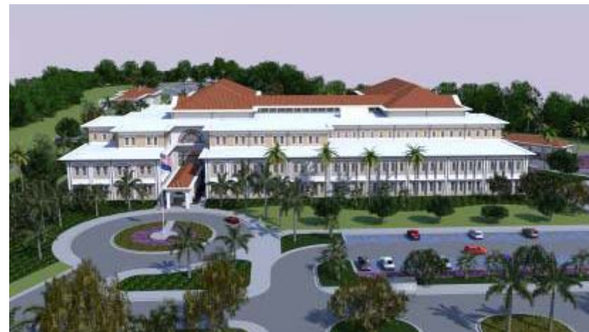
Naval Hospital Rendering